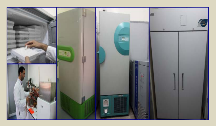
Infrastructure for preservation of CCMM holding

For more details see <u>www.ccmm.ma</u>.