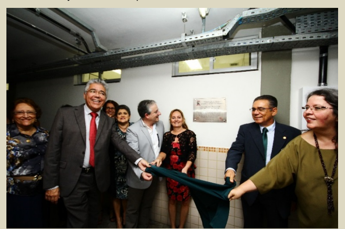
Figure 3: Inauguration of the new installations of the URM Culture Collection in the Federal University of Pernambuco, Brazil.