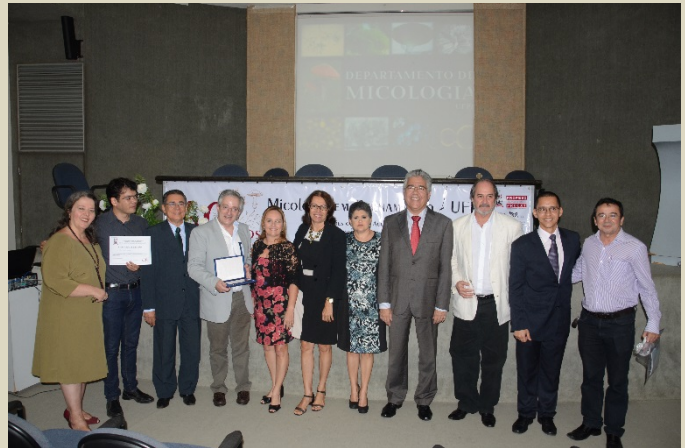
Figure 2: Tribute to various Professors and Staff-Members, involved over the last years in the departmental and collection activities.